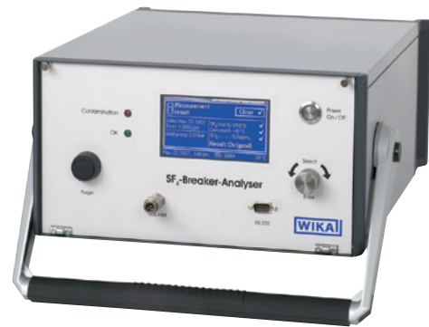
Analysis instrument, model GA10